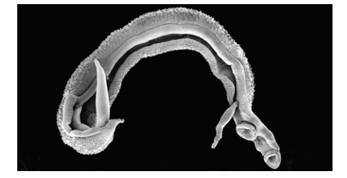
Fig. 3 Electron micrograph of a male/female pair of adult schistosomes.

The human body doesn't suspect their presence because the worms disguise themselves with a coating of protein similar to that of the host. This coating fools the human's defense system,