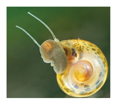
Fig. 1 Biomphalaria fresh-water snail.

www.iamat.org | info@iamat.org | Twitter@IAMAT_Travel | Facebook IAMATHealth